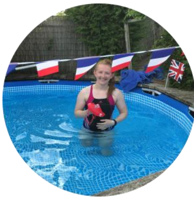
Georgia swam the length of the channel