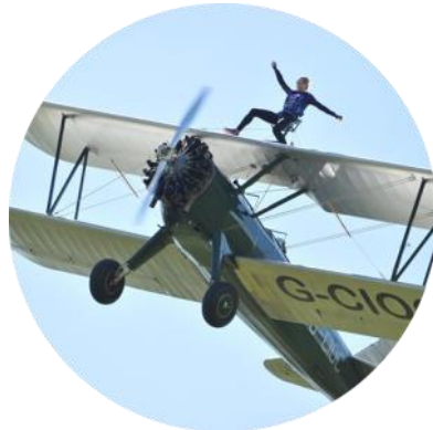
Abby took on a wingwalk